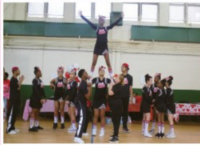
P.S. 89 Panthers cheerleaders performance.

Alpha Kappa Alpha Sorority Incorporated, Eta Omega Omega Chapter and Delta Sigma Theta Sorority Incorporated Bronx Alumnae Chapter held a 'Pink Goes Red' event at Forest Gym, 955 Tinton Avenue, for American Heart Month on Saturday, February 1. Activities featured at the event included free blood pressure and glucose screenings, health and nutrition tips, self defense courses for kids and zumba for adults.