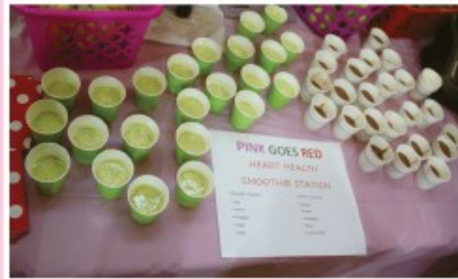
Pink Goes Red smoothie station.