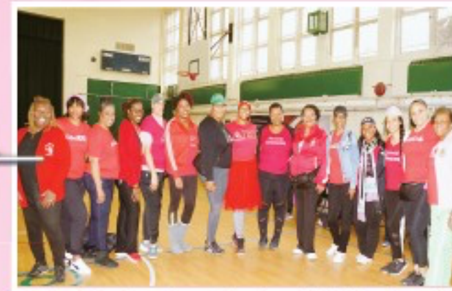
Participants, board members and members of both Alpha Kappa Alpha Sorority, Bronx Chapter, and Delta Sigma Theta Sorority.